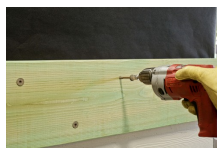
Exterior timber element fastening