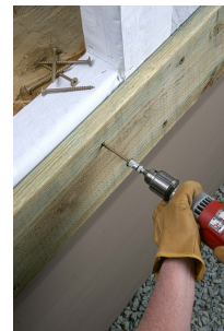
Stud wall assembly