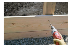
Exterior timber element fastening