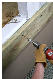
Stud wall assembly